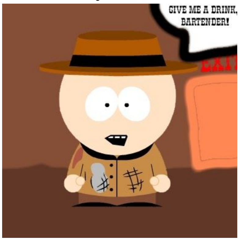
"When he got inside, he asked the bartender to give him a drink."

He decided to go to the saloon. When he got inside, he asked the bartender to give him a drink.