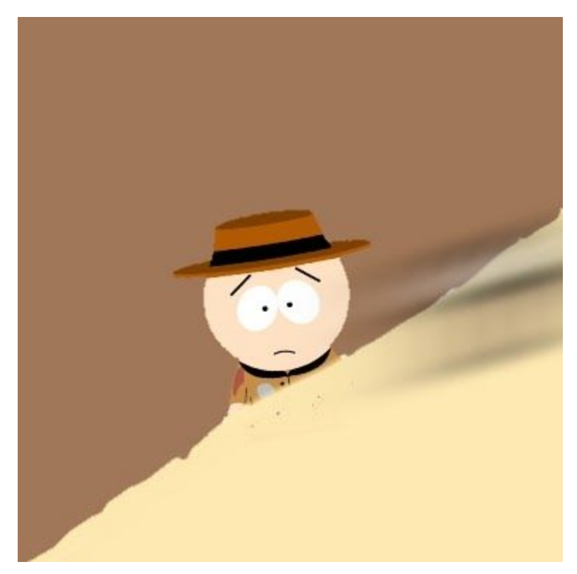
"Shane the man missed it."

So the man went out of the saloon, and there was the "Nasty Ned" everyone was talking about. Nasty Ned asked Shane the man if he was Billy Bob.