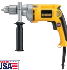
1/2" Drill DW235G