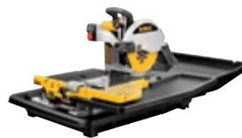
10" Wet Tile Saw D24000

D24001 Wet Tile Saw Stand, 10" Porcelain Tile Blade, Summersible Pump, Water Pan, Side and Rear Water Trays, Cutting Cart Side Extension, Angle/Rip Guide, Blade Change Wrench, and Hex Wrench