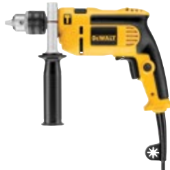
1/2" Single Speed Hammerdrill DWE5010