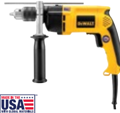
1/2" Single Speed Hammer Drill DW511