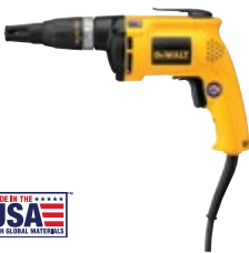
Drywall Screwgun DW252