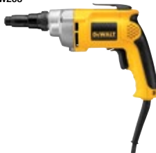
2500 rpm VERSA-CLUTCH™ Screwgun DW268