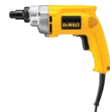
Positive-Clutch Screwgun DW281