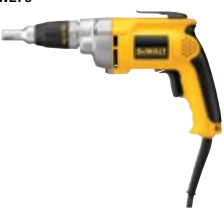
Heavy-Duty All-Purpose Screwgun DW276