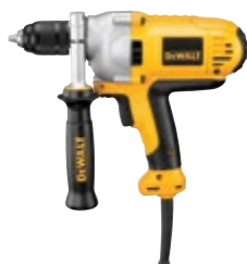
1/2" Mid-Handle Grip Drill DWD215G