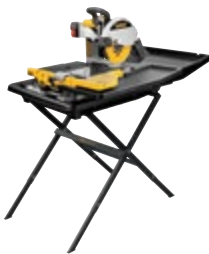
10" Wet Tile Saw with Stand D24000S