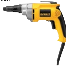
2000 rpm VERSA-CLUTCH™ Screwgun DW267