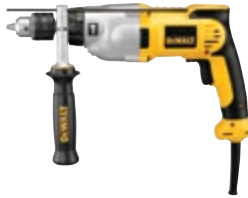
1/2" Pistol Grip Hammer Drill DWD520