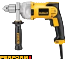
1/2" Pistol Grip Drill with Anti-Lock Control DWD220