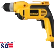
3/8" Pistol Grip Drill Kit DWD110K