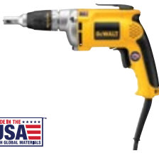
Premium Drywall Screwgun DW272