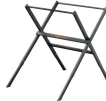
Wet Tile Saw Stand D24001

12" Water Line and Regulator, 4-3/8" Diamond Blade, and (2) Blade Change Wrenches