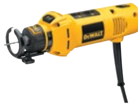
Cut-Out Tool DW660