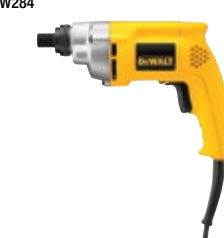
Positive-Clutch Screwgun with Threaded Clutch Housing DW284