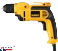
3/8" Pistol Grip Drill DWD112