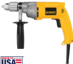
1/2" Drill DW245