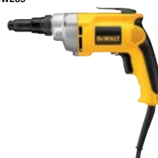
1000 rpm VERSA-CLUTCH™ Screwgun DW269