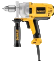
1/2" Mid-Handle Grip Drill DWD216G