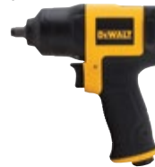
3/8" Impact Wrench DWMT70775