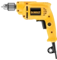
3/8" Drill DWE1014