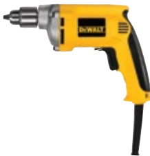
1/4" Drill DW217