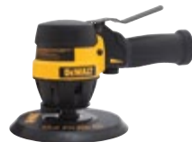
Dual Action Sander DWMT70780