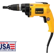
All-Purpose Screwgun DW257