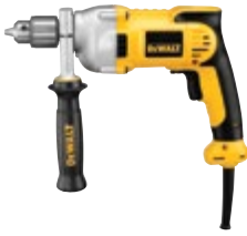
1/2" Pistol Grip Drill DWD210G