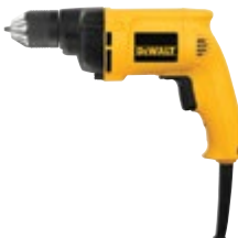
3/8" Drill DW222