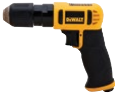
3/8" Reversible Drill DWMT70786L