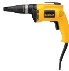
High-Speed Drywall Screwgun DW255