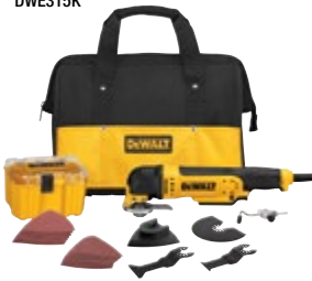
Oscillating Multi-Tool Kit DWE315K