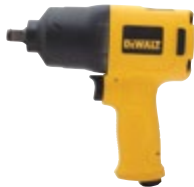
1/2" Medium-Duty Impact Wrench DWMT70774