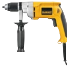
1/2" Drill DW246