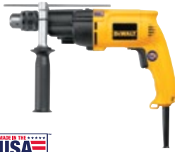
1/2" Dual Range Hammer Drill DW505