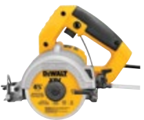
4-3/8" Wet/Dry Handheld Tile Saw DWC860W

10" Porcelain Tile Blade, Summersible Pump, Water Pan, Side and Rear Water Trays, Cutting Cart Side Extension, Angle/Rip Guide, Blade Change Wrench, and Hex Wrench