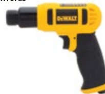
Chisel Hammer DWMT70785