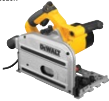
6-1/2" TrackSaw™ Kit DWS520K