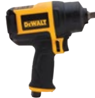
1/2" Heavy-Duty Impact Wrench DWMT70773L