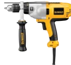
1/2" Mid-Handle Grip Hammer Drill Kit DWD525K