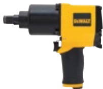
3/4" Impact Wrench DWMT74271