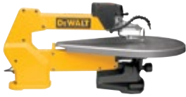
20" Variable Speed Scroll Saw DW788