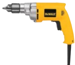
3/8" Drill DW223G