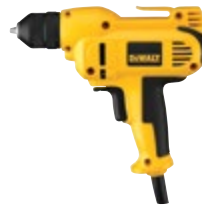
3/8" Mid-Handle Drill Kit DWD115K