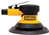
Palm Sander DWMT70781L