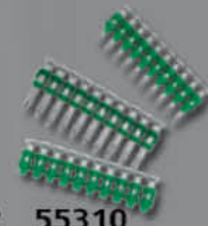
55310 55336 55342 Pins