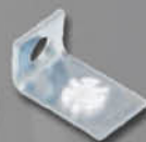
55092 Right Angle Clip