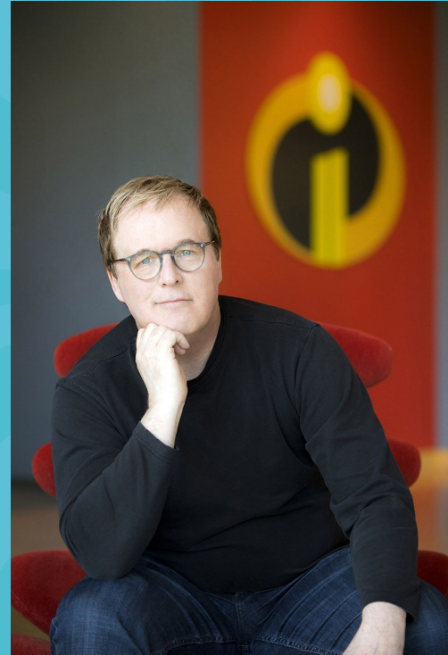
Brad Bird, writer and director of The Incredibles