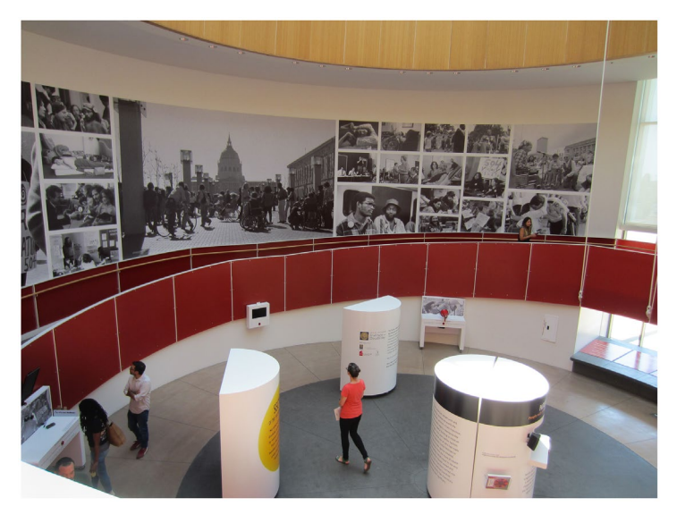
Figure 3 Patient No More exhibit, shown on in the atrium of the Ed Roberts Campus, Berkeley, California.